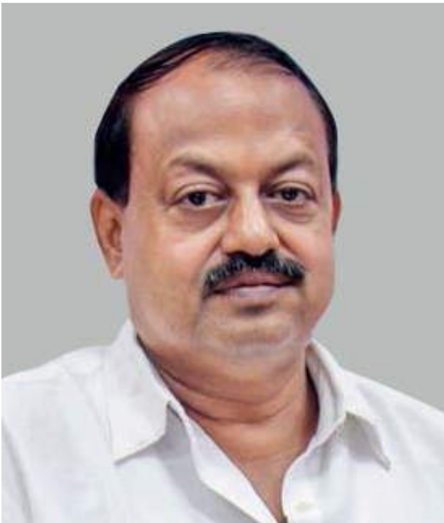
DEBI PRASAD MISHRA Hon'ble Industries Minister

The policy places greater importance on supporting industrial infrastructure initiatives and an enabling framework for development of industrial clusters by the user industries. The sectoral focus of the policy coupled with the resource availability and a competitive eco-system opens up wide opportunity to the investing community to set up their base in the state. I am sure that this policy will be a precursor for faster and sustainable industrial growth of Odisha.