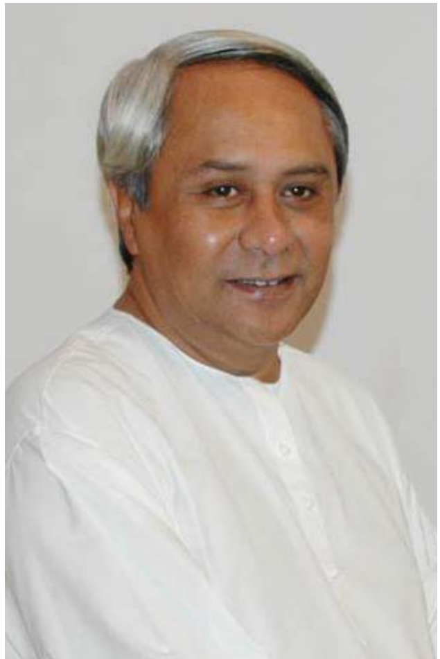
NAVEEN PATNAIK Hon'ble Chief Minister